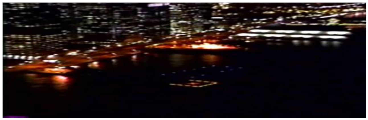
From the Video of the Downtown Manhattan Helipad during FAA and PANYNJ trial.

Please Note: A video of this FAA trial can be found at <a href="www.ledline.net">www.ledline.net</a> under the helipad section. The video documents both standard FAA point source visual aids vs. linear visual aids on the same helipad. Directly comparing the two visual aids, clearly demonstrates why linear visual aids, at all approach angles, are better and so why the pilot's ratings there were so favourable. The Downtown Manhattan Helipad, FAA / (PANYNJ) Linear Helipad Trials, published by the FAA Nov 1999 (DOT/FAA/ND-99/1) is public and still available.