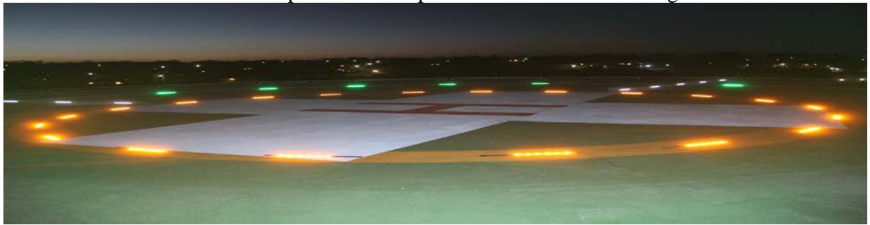
Please Note: It is clearly the lit linear LEDline® rather than the increased ambient light that makes the difference of clearly differentiating the helipad area, despite the low viewing angle.

The same identical Kilmore Hospital Australia picture with more ambient light.